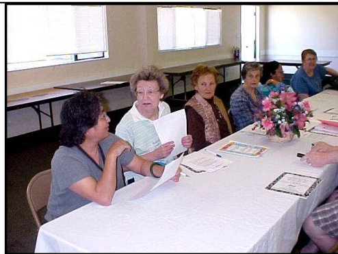
The Fundraising Committee is currently planning a Mother's Day Salad Luncheon. Please see page two for details.

Pray for our staff that they will not lose the vision to minister to the residents. And for you who exercise your faith by giving, be encouraged to "Cast your bread upon the waters, for you shall find it after many days." (Ecclesiastes 11:1) We never know what miracle we might experience. Ministry must be done in faith.